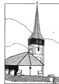
Várfalva Unitarian Church